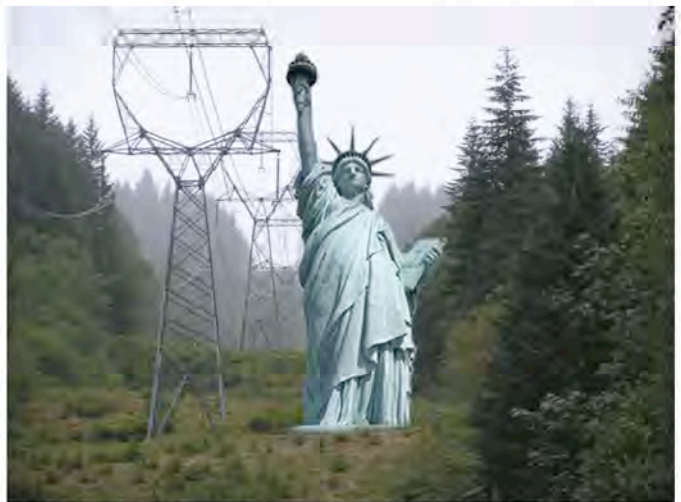
From its base, the Statue of Liberty stands 151 feet tall, while transmission towers can reach heights of 165 feet.

No. The drive for new transmission lines is about profits, not reliability. Pennsylvania is a net exporter of electricity.